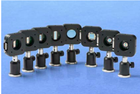
PSD Holder MH01 selection

SiTek's high linearity PSDs are also available in a mechanical holder suitable for optical system setups. The mechanical holder MH01 has a size of only 52 x 52 mm 2 and the PSD is easily accessed via a DSUB9 connector. It is designed to fit ø1" filters as well as standard optomechanical components, such as posts and lens tubes. To minimize reflections it has a black anodized surface.